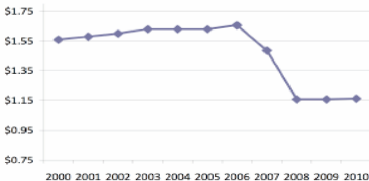
AHISD Total Tax Rate History